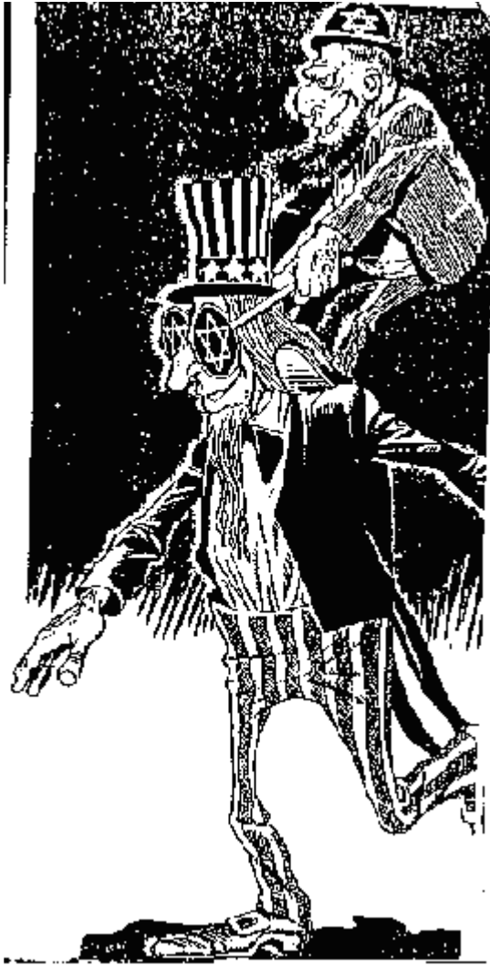
Cartoon from The Radio Islam Website

Another important theme is the Holocaust, especially from Palestinian and pro-Palestinian sources, but the comparisons between Israel and Nazis are more widely networked: